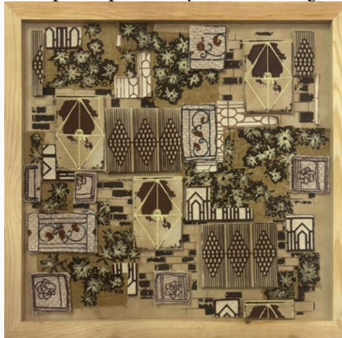
Title: “Mingled Biotas” Dimensions: 25/25 inch Medium: Fiber Art

“Mingled Biotas” explores the delicate balance of nature and our interconnected relationship with the environment. Through various intricate techniques of fiber art and interplay of textures, this piece symbolizes the unity and fragility of ecosystems. The dimensions, represent a concentrated glimpse of the broader ecological landscape, inviting the viewer to consider the intricate threads that bind every living element together. This work is a call to reflect on the beauty and complexity of our natural world, encouraging both appreciation and a deeper responsibility toward ecological harmony.