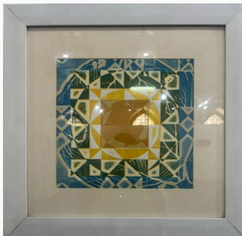
Title: "Wirsa" Medium: Photo Etching Size: 12x12 inch

The Art piece is a reflection of the existence of original cultural essence of Lahore.