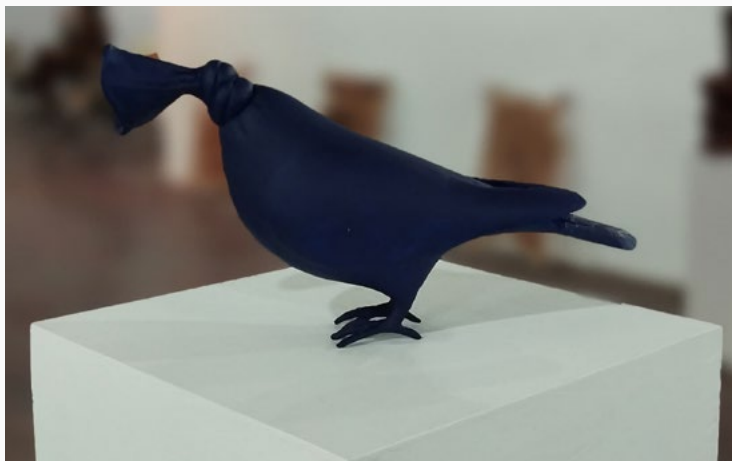
Title : Khudgarzi Medium : Fiberglass Size : 10x8x4

“My work delves into the profound interconnectedness between human actions and the environment, shaped by my personal journey as a former hunter. Through this transformation, I have gained a deep awareness of how hunting disrupts ecosystems, affecting both wildlife and humanity. In my art, I replace birds with balloons, using vibrant colors and deliberate forms to emphasize coexistence while diminishing the prominence of guns. This visual metaphor narrates a shift from harm to preservation, questioning the role of firearms and advocating for ecological harmony.