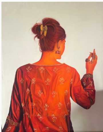
Title: Untitled Medium: Oil on canvas Size: 24x30 inches

My artwork is a striking exploration of emotion and identity, utilizing rich red tones and warm orange reflections to create a sense of depth and vibrancy. Through the interplay of light and shadow, I capture the essence of my subject, emphasizing the beauty of self-expression and the emotional resonance of color. My work stands as a testament to the power of art to convey complex human experiences. The choice of red and orange hues reflects a warmth and vibrancy that draws the eye, while the interplay of light and shadow adds depth and dimension to the piece.