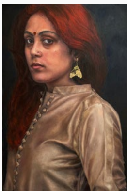
Title: "Untitled" Medium: Oil on Canvas Size: 21x31 inch

In my work, I explore the question: Who am I? I often think about how others perceive me and how I view myself. Many people have different sides to their personality, but fear of judgment causes us to hide our true selves. We hold back, afraid of how others might react. While some may not experience this fear, I believe most do. This inner struggle can lead to issues like difficulty making decisions, suppressing emotions, and being less understanding of others. Through my art, I aim to explore these hidden aspects of people and how society's expectations shape our actions and feelings. We are united, yet not truly one; no matter how much we try, we never fully reveal ourselves.