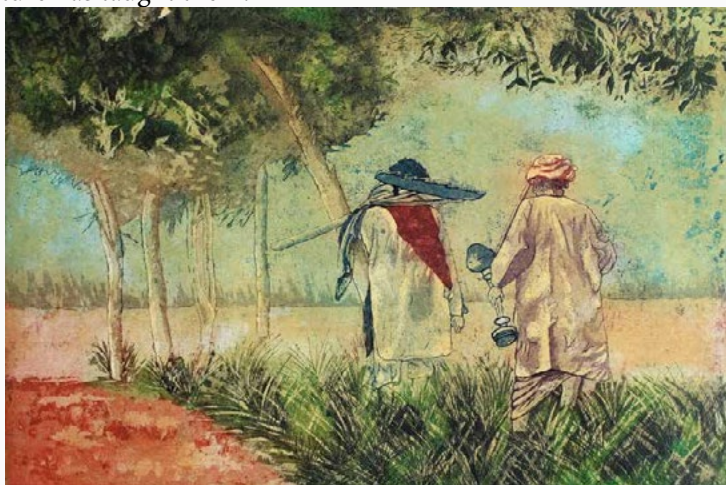
"Bany Banao Chalyn" (2019)

There is a misconception that farmers are 'uneducated', but in reality, they are the keepers of unmatched knowledge that mother nature has taught them.