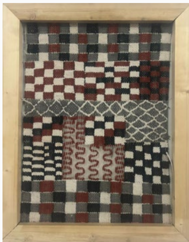
TITLE: Ecologically Entwined SIZE: 18 by 24 inches MEDIUM: Fiber Art

Weaving is the first known method of fabric production to mankind. To date, this primeval method has proven to be one of those that require the least carbon footprints. This art piece is created under the influence of “charpai” or portable light bed which is a prevalent form of furniture in our region that is woven by hand to date. The weaving has the patterns of those traditions in Punjab and whereabouts. The material used in this art piece is wool which is completely natural fiber and is ecologically friendly.