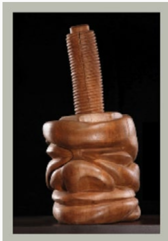
Title: Trance-1 Medium: Wood Size: 24

The review of the viewer is my statement.