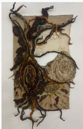
Title: Reconfiguration; Upcycling Textile Waste Medium: Fiber Art Size: 5 by 4 feet

I created Textile Bark, inspired by Tree barks around us. Trees are delegates of existence around us. My Textile bark has immense potential as art installation that has explored various themes of sustainability, recycling, and transformation. My innovative approach contributes towards reducing textile waste hence yielding treasures of creativity out of waste. . By Using Textile techniques like fabric slashing, fabric manipulation, fabric coiling, fabric burning, embroidery, embellishments and beadwork an exclusive form has emerged and these techniques compliment my project of upcycling of the waste fabric.