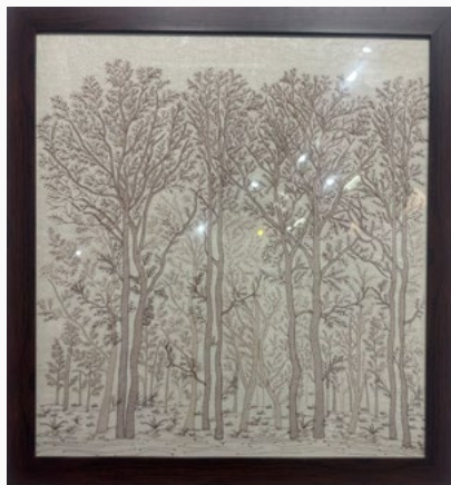
Title: “Resilient Roots” Medium: Embroidery Size: 20 x 20 inches

“Resilient Roots” explores the enduring connection between humanity and nature, emphasizing sustainability and the power of regeneration. The trees depicted represent not only the natural world’s beauty but also its capacity to withstand the pressures of modern life. By presenting a raw, unembellished portrayal, the work invites viewers to reflect on our role in nurturing the environment and the delicate balance required to sustain it. This piece urges an appreciation of nature in its purest form, even in its moments of vulnerability, reminding us that sustainability begins with understanding and preserving what we might overlook.