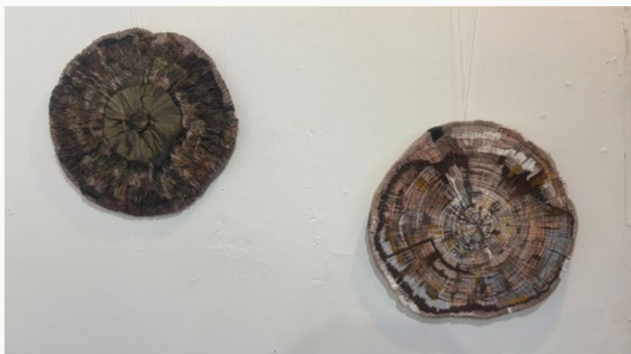
Title: Folds of Nature Medium: Fiber Art Size: 12 inches diameter

In “Through Folds of Nature,” I explore climate change through material transformation and sustainability. My work features intricate layers resembling tree bark, symbolizing strength and biodiversity. The sculptural rings, crafted through fabric manipulation, represent the cumulative stresses on ecosystems from rising temperatures and habitat loss. I aim to inspire dialogue on sustainability, encouraging viewers to reflect on their impact on the planet’s fragile ecosystems.