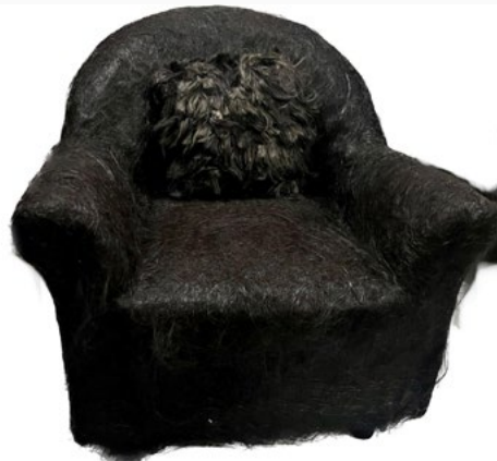
Title: "Tangled Histories" Medium: Synthetic and Human Hair Size: Life Size

My artwork explores the misunderstood experiences of OCD and hair fall, using human hair as both a medium and symbol. Hair, a personal and intimate material, represents identity, control, and vulnerability. Its fall highlights anxiety and the loss of control, mirroring the emotional strain of OCD. By arranging hair in repetitive patterns, I reflect the compulsions that seek order amidst mental chaos. Each piece expresses the struggle between control and inevitable change. My work makes visible the often hidden struggles of mental health, inviting empathy and understanding. It highlights human vulnerability, resilience, and the pursuit of balance.