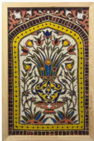
Title-Dawn of a former Bequest Medium- Fiber Art Size- 44"x24" 40"x24"

The purpose of my work is to recreate and restore the Mughal art in textile form by using the fiber art technique of cut and slash. This work is done by using different leftover fabrics and combination of various colours produce a spectacular image, which is highly sustainable and eco-friendly. I developed different designs like fresco, geometrical and floral patterns and the colours are very appealing to eyes. Textile material offers a broad consultation, visual impact, durability, mobility, community engagement, versatility and economic viability.