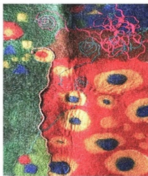
Title: Resilient Ecologies Size: 28 x 28 inches each. Medium: Fiber Art

Felting is an eco-friendly practice that uses natural materials and minimal waste. As sustainability gains importance in textiles, namdah and other felted textiles emerge as conscious choices. This centuries-old process lets me explore the connection between nature and culture, with vibrant colors reflecting the diverse landscapes of South Asia—from Hunza's cherry blossoms to the Thar desert's chilly nights. By blending contemporary design with traditional craftsmanship, I evoke nostalgia while celebrating the resilience of these textile traditions. My work invites viewers to connect emotionally with the landscape and honors the heritage of namdah while envisioning its future in modern art.